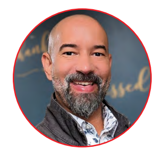
MA, LPC, CATP, NCC

Behavioral Health Therapist Geneva College